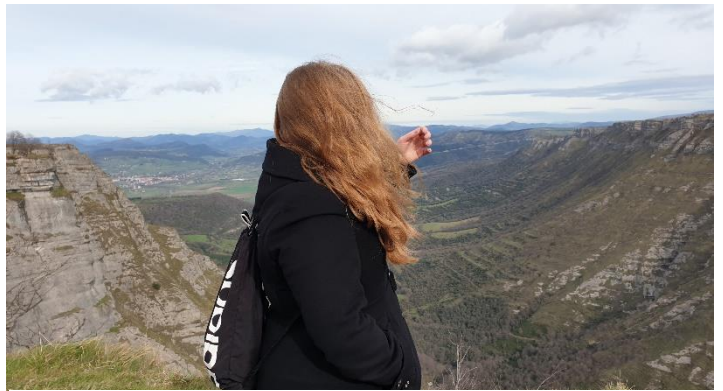
Salto del Nervión

The other organization, Happy Erasmus also had all these trips and events in bars. With them I went to Vitoria-Gasteiz, Salto del Nervión and Bordeaux. This organization I did not like that much however. The way they organized the trips was not very fluent, looking back, they were kind of overpriced and also, the organizers were very out of the group and not volunteers, but workers. Their trips compared to the ones held by ESN were too formal and not that liberate.