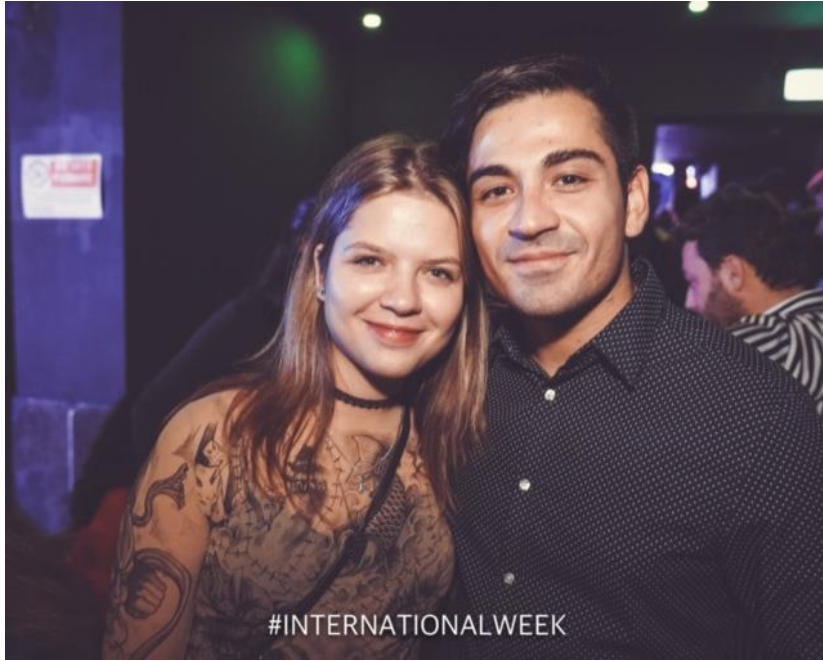
Me and my buddy