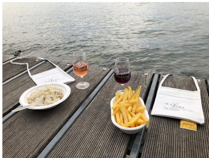
going to a one day trip to Sirmione and Bardolino (to the wine festival!)