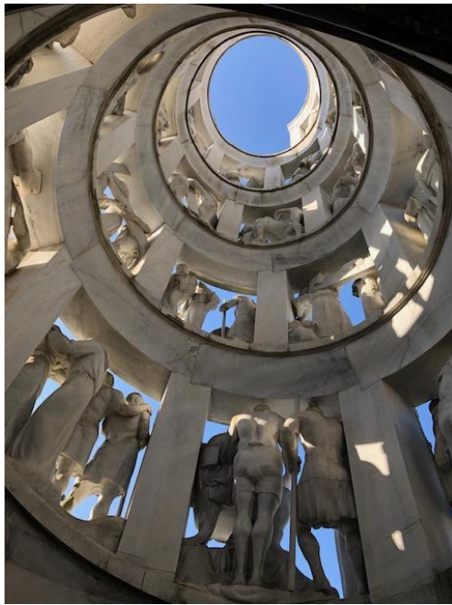
visiting the popular Monumental Cemetery with free tour guide