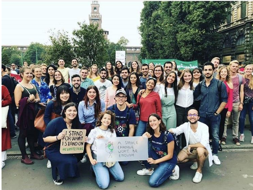
protest against climate change